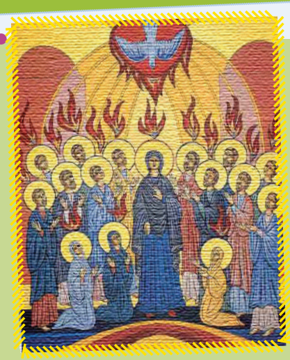
Based on Acts 2

Jesus' disciples were praying together in the upper room. All of a sudden a noise like a strong wind filled the room. The disciples were surprised as they saw tongues of fire appear on each of them. At that moment, they were speaking different languages that they did not know. The people of Jerusalem heard all of the noise and wanted to see what was happening. Everyone was shocked and asked them how they learned to speak these languages. Peter said that all of these events were part of God's plan. God sent his Son Jesus to save his people from sin. As promised, God sent the Holy Spirit to give the disciples the ability to spread the message of God. Peter then told the people that they should seek forgiveness from Jesus and be baptized. That day, over 3000 people were baptized by the disciples and became Christians. It was the birthday of the Church.