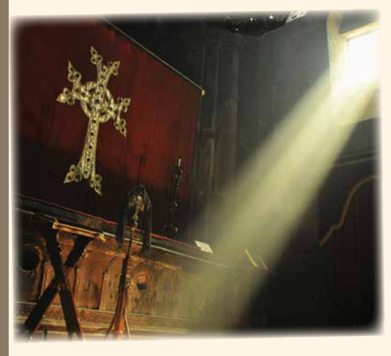
Thank you, God, for your great mercy! Amen.