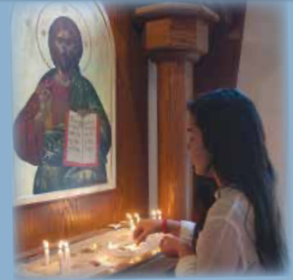
Psalm 5: 1-3