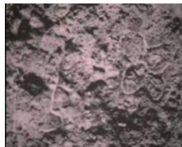
Armenian letter Է (Ē) found in Metsamor (3,000 BCE)