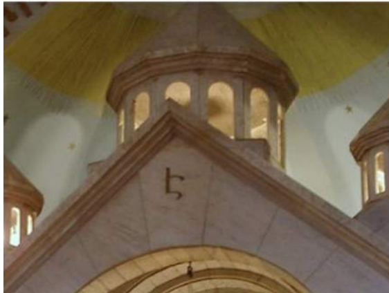
Altar of the Armenian Church of the Forty Martyrs, Aleppo

SAY: Raise your hand if you know any letters in the Armenian alphabet. (Pause) Who can tell me the 7 th letter of the Armenian alphabet? Let's try saying the alphabet together and count the letters as we go. Ready? (As you say the letters of the alphabet (below) together with the children, count them by holding up your fingers.) "Ayp, pen, keem tah, yech, za, EH! " The 7 th letter is "Eh!" (Write this letter on the board/chart paper) Է