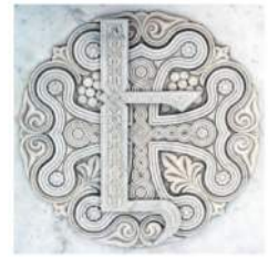
Sign on a marble Khatchkar (Cross Stone) in the Holy Etchmiadzin.

was instructing Moses to deliver His people from Egypt, Moses asked, "If I come to the Israelites and say to them, 'The God of your ancestors has sent me to you,' and they ask me, 'What is his name?' what shall I say to them?" God said to Moses, "I am who I am." He said further, "Thus you shall say to the Israelites, 'I am has sent me to you.' God told Moses that His name is 'I am', or technically 'Is', or 'He Who Is'. Thus, God is a being who just IS, and it is only the eternal God who can call Himself by this name. In Armenian, it is the letter/word 'Eh' that serves as the name for 'I am' or 'he is', and just as Moses realized the 'Eh' to be dwelling in the burning bush, so too does the Armenian Church realize that God (Eh) dwells at the church altar.