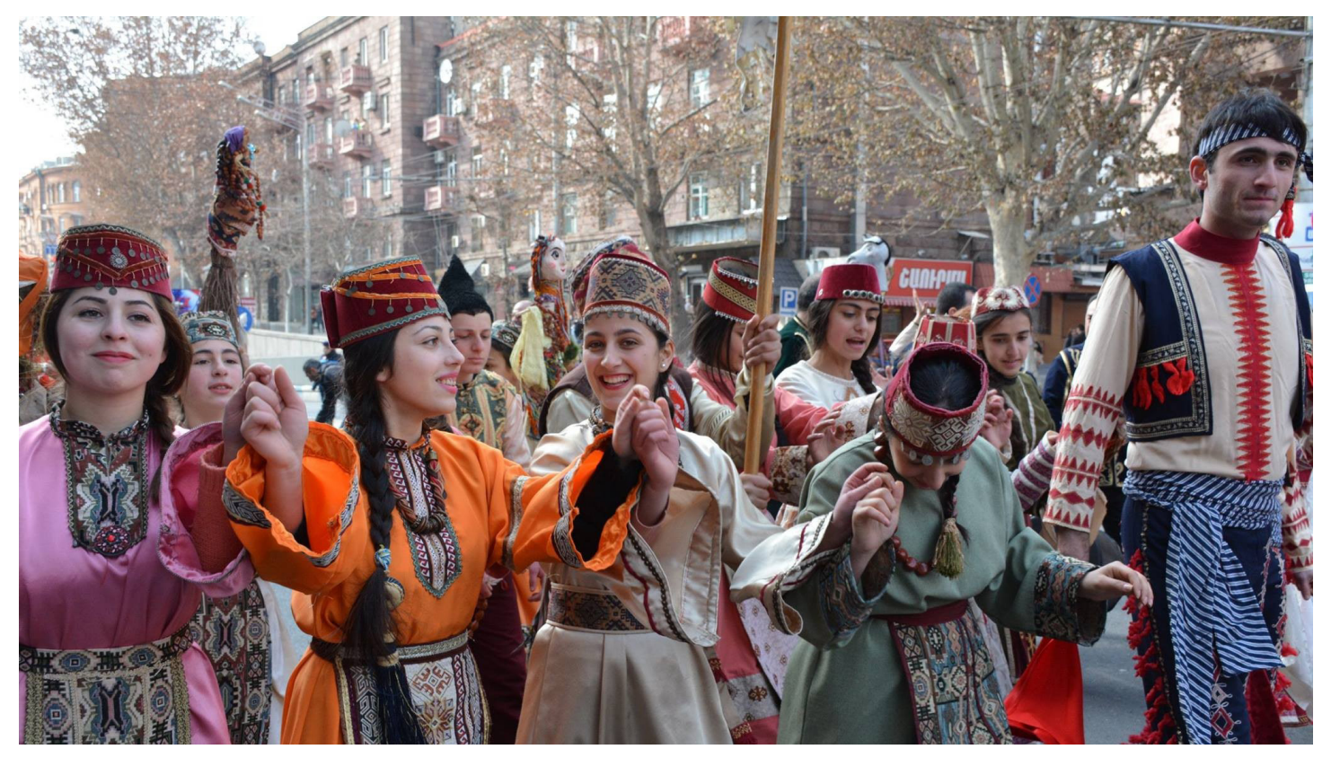
Poon Paregentan Celebration in Armenia