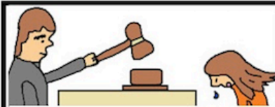
Luke 18:1-8 Parable of Widow Woman and Unjust Judge