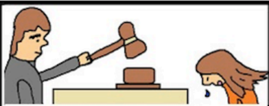
Luke 18:1-8 Parable of Widow Woman and Unjust Judge