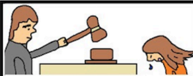
Luke 18:1-8 Parable of Widow Woman and Unjust Judge