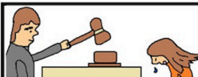
Luke 18:1-8 Parable of Widow Woman and Unjust Judge