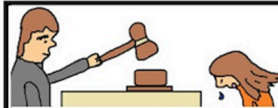
Luke 18:1-8 Parable of Widow Woman and Unjust Judge