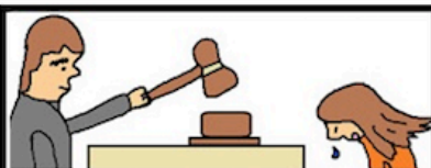
Luke 18:1-8 Parable of Widow Woman and Unjust Judge