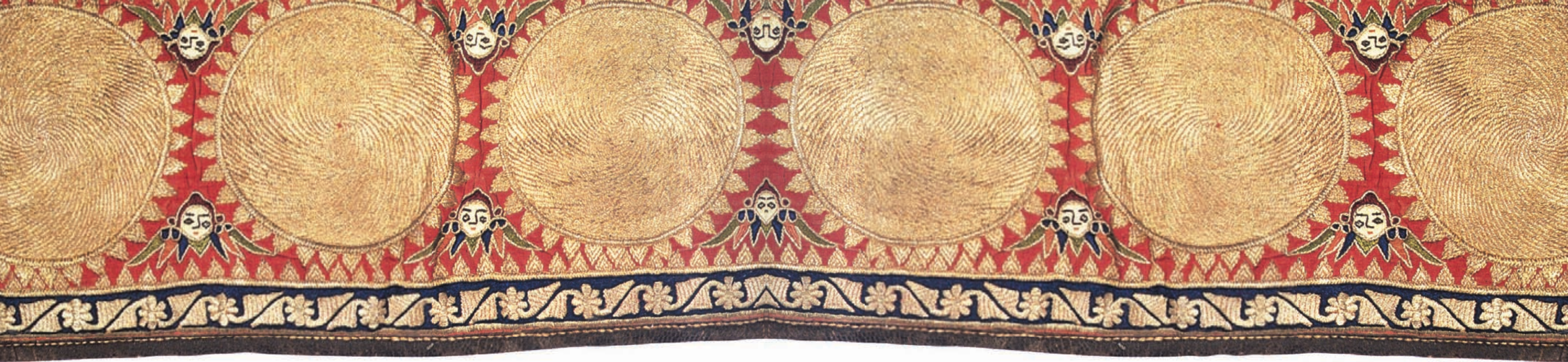
Angels depicted on a priest's ceremonial collar, or vagas , 1746.

YOU MIGHT SAY THAT THE VITAL NERVE OF ARMENIAN CHURCH theology vibrates with the same idea of opposites being united: of humble surfaces masking glorious realities; of the merely human being transformed into the divine. The prominence given to the Feast of the Transfiguration in the Armenian Church—it's one of the five major celebrations of the year—shows how the church conveyed these delicate theological ideas to the broad community of faith.