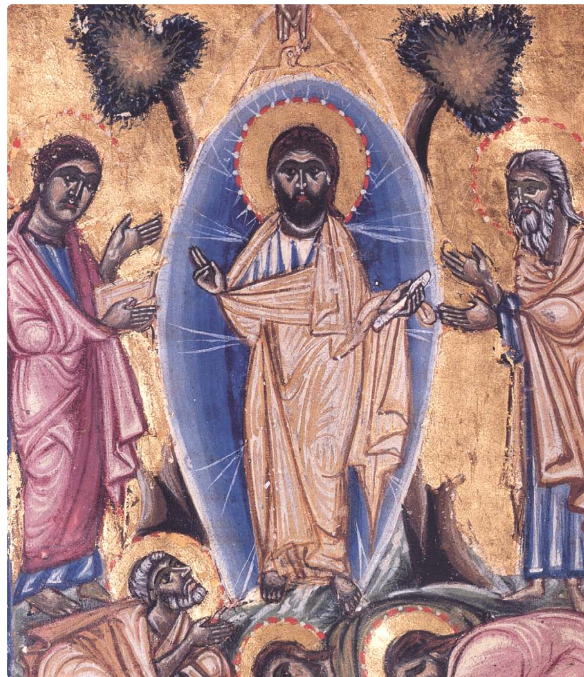
This depiction of the Transfiguration appears in the 14th-century Gladzor Gospels.