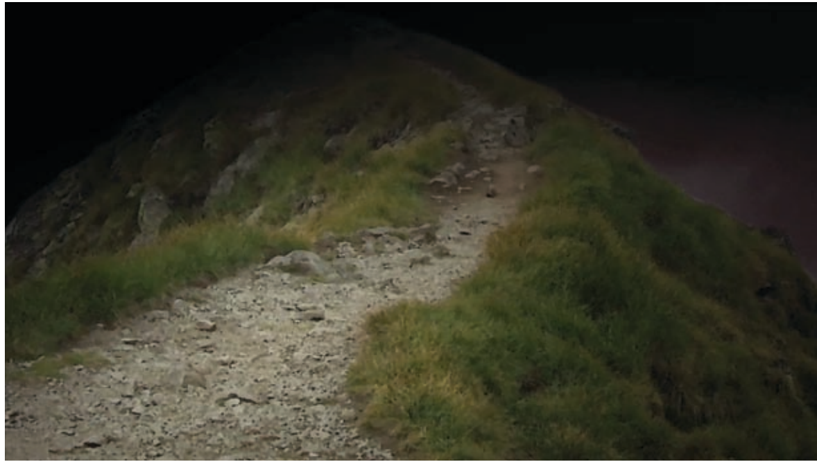
MOVIE: What the disciples saw on Mount Tabor