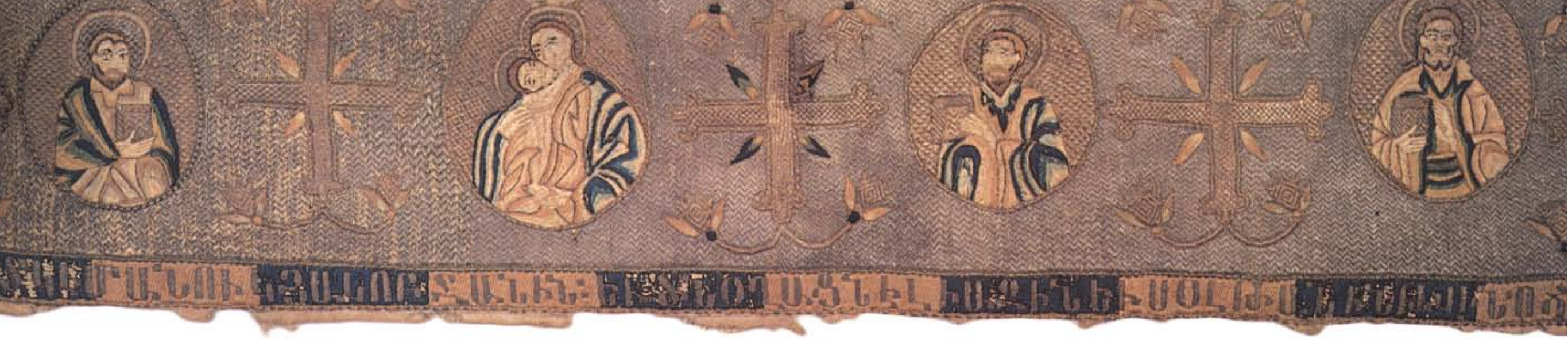
St. Mary and the Gospel writers depicted on a priest's ceremonial collar, or vagas , 1691.

THE GOSPEL WRITERS MATTHEW, MARK, AND LUKE sketch the tale in just a few tantalizingly brief lines. But the Transfiguration captured the imagination of Christians early on: they recognized that it revealed something critically important about Jesus, and celebrated the Transfiguration as one of the feasts of the church.