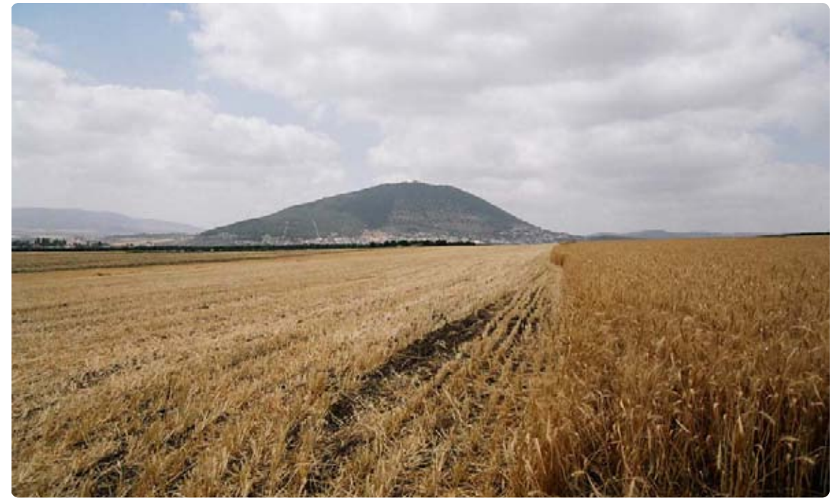
A view of Mount Tabor.