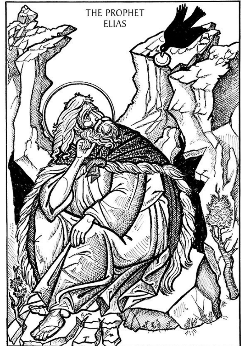
THE PROPHET ELIAS

Fathers, teach your children to pray. Teach them to turn prayer into a life partner. Throughout the years, with the ups and downs of life, they may forget to pray, but be sure that if the spirit of prayer has been impressed on the child by the father, even if it is silent for many years, eventually, at the right time, just like sweet incense, it will begin to flare up and release its aroma towards heaven.