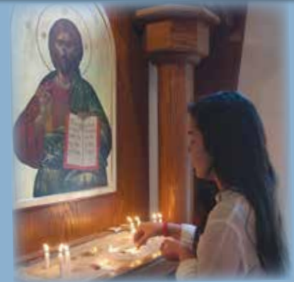
Psalm 5: 1-3