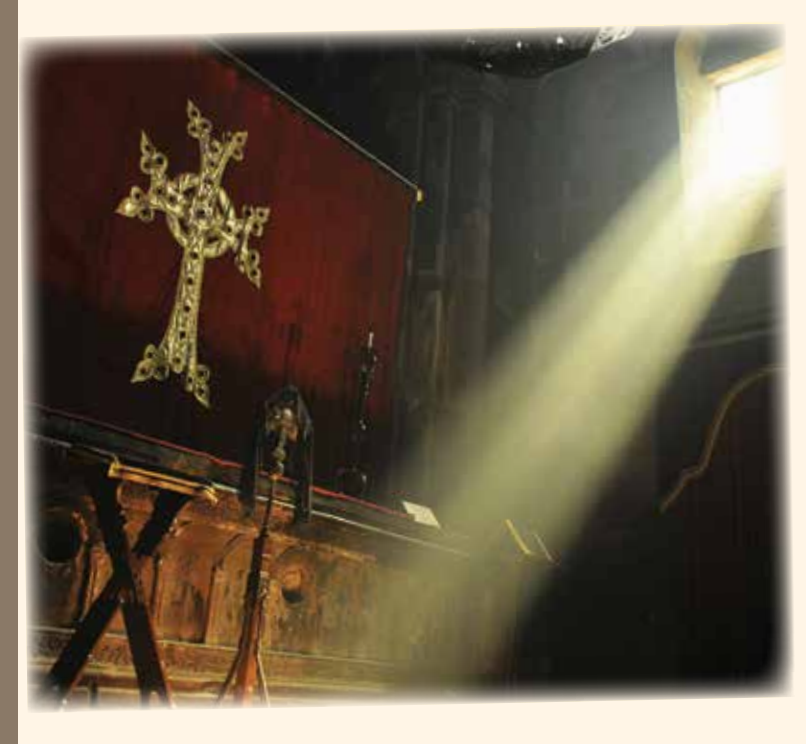
Thank you, God, for your great mercy! Amen.