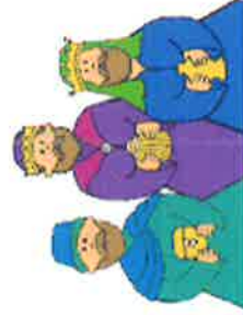
Standup Nativity Scene