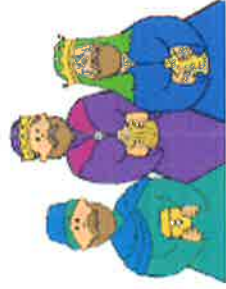
Standup Nativity Scene