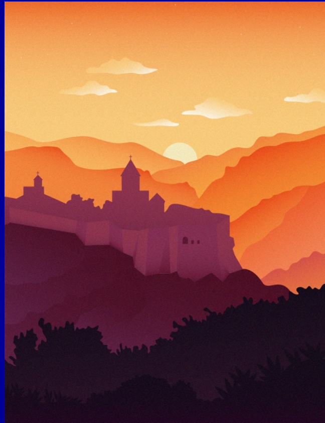
Tatev Monastery, Armenia